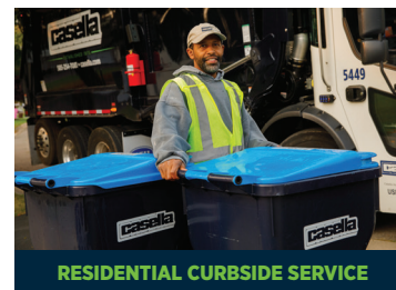
RESIDENTIAL CURBSIDE SERVICE