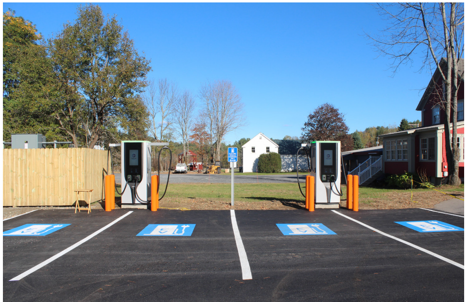
Cellerate's chargers will be the fastest in Vermont

In line with a community-based ethos, the charging station also plans to serve as a platform to promote local, independent, Vermont businesses. Each station will be equipped with a digital display that Erik intends to use to feature local community